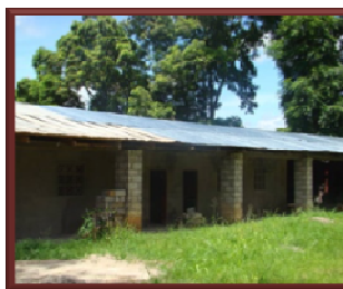
Uniting Building—RoofSheeting & External Plastering nearing completion

Plastering and roof sheeting of the Uniting Building is nearing completion. Need still remains for connection to electricity and painting. Estimated cost AUD$3,700. Our need for roof sheeting for 2 housing units under construction remains. Estimated cost AUD$4,375.